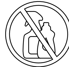
Avoid household cleaning products

Address any spills immediately with a soft, lint-free cloth. Avoid using paper towels as these may be abrasive and lead to damage. Blot any staining dry, and clean any residue with a well wrung, soft and clean cloth and a heavily diluted soap and water solution.