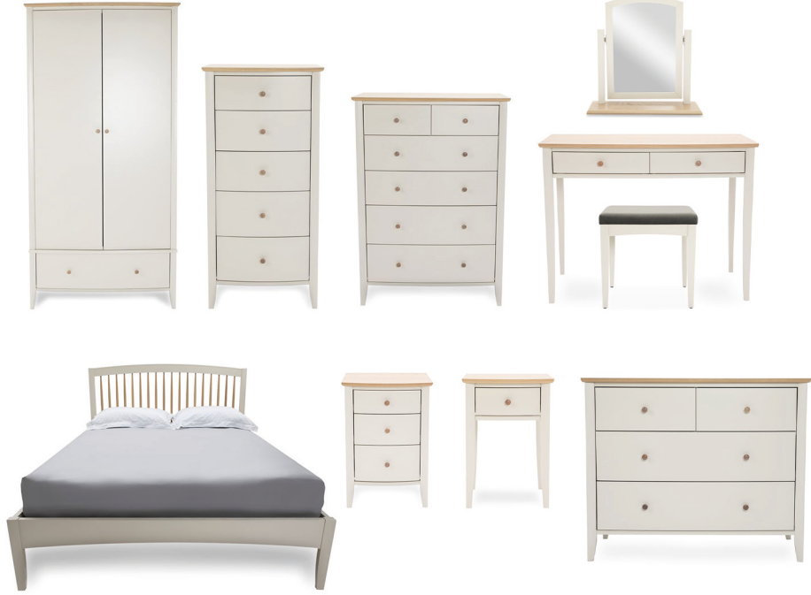
WHITBY Bedroom Range